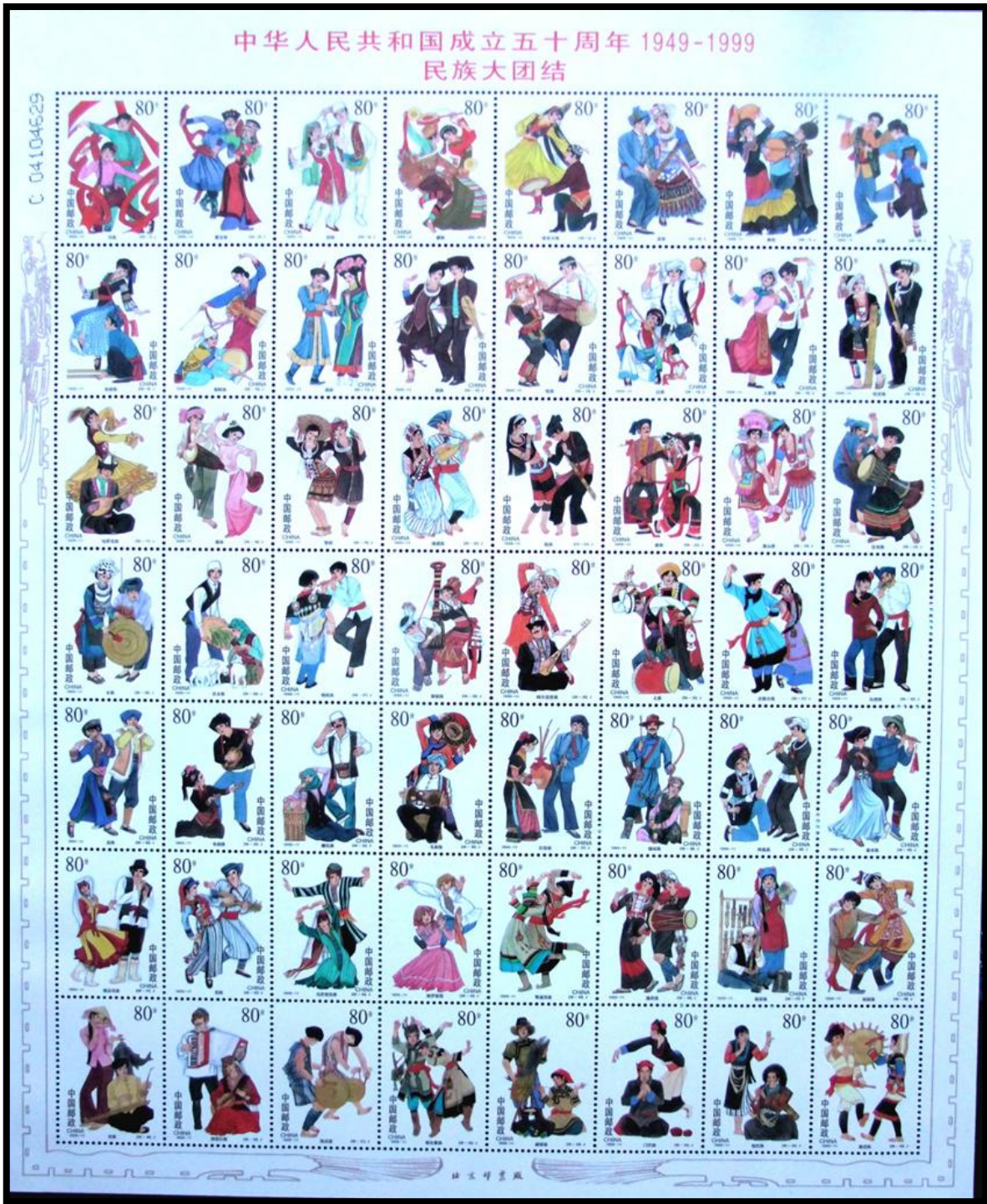
Fig. 5-4.10. The sheet with the conventional 56 Chinese stamps.