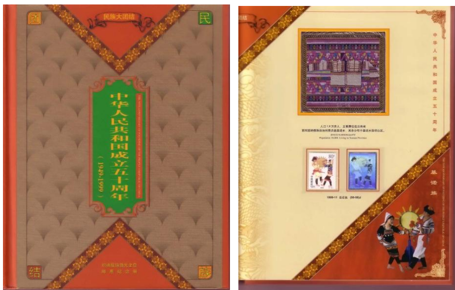
Fig. 5-4.7. The ‘Chinese Ethnic Folk Groups’ album cover and one page in the album.