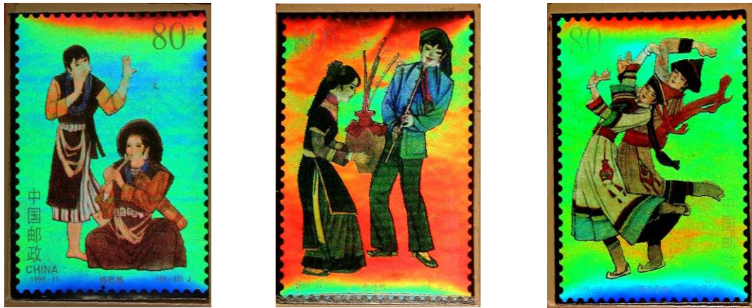
Fig. 5-4.8. Three examples of the 56 Chinese hologram stamps.